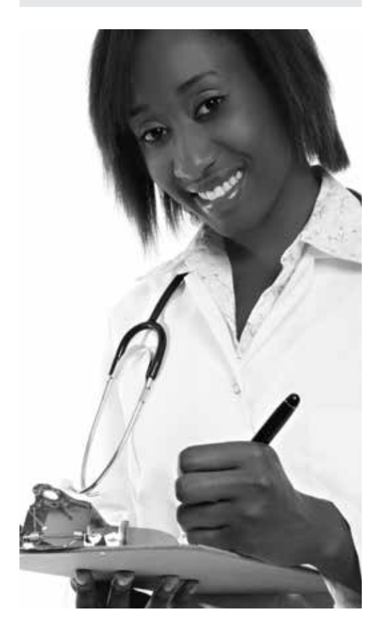
Table of Contents Bayou Health Plans Earn High Marks from External Review Changes Regarding Tuberculosis Testing for Nursing Facilities Reminder Federally Qualified Health Centers Satellite Site Enrollment Reminder 2 Update to "ClaimCheck" Product Editing Remittance Advice Corner 3-5 Online Medicaid Provider Manual Chapters Preventing Toxicities in Patients Receiving Endocrine Therapy for Breast Cancer 7-11

Additional information about the reports is posted online MakingMedicaidBetter.com.